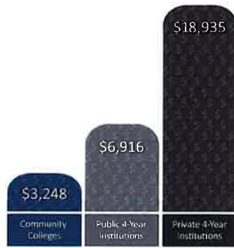
IACRAO – Higher Education in Idaho 2015-2016 Annual Tuition – 12 Credit Hours per Semester