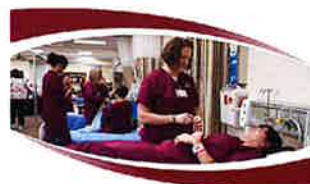
2017 Idaho Community Colleges