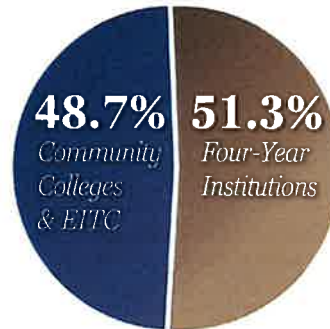
PSR 1 Fall 2016 Snapshot