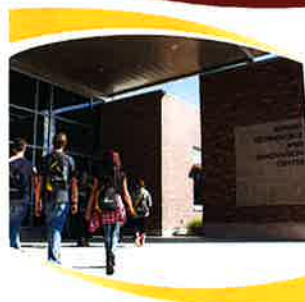
2017 Idaho Community Colleges