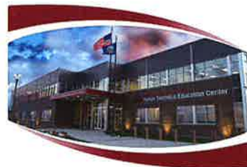
2017 Idaho Community Colleges