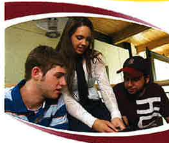
2017 Idaho Community Colleges