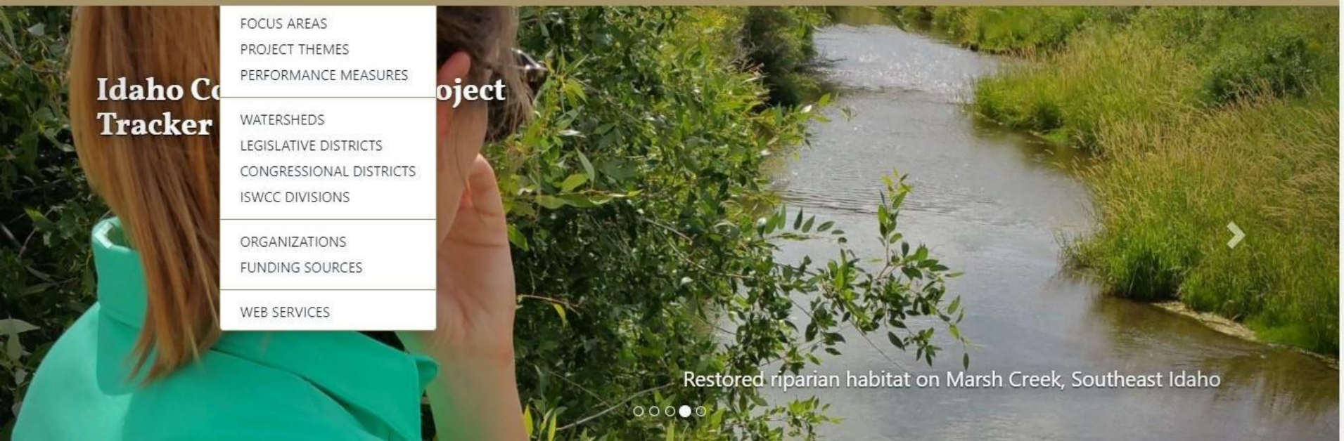
Restored riparian habitat on Marsh Creek, Southeast Idaho