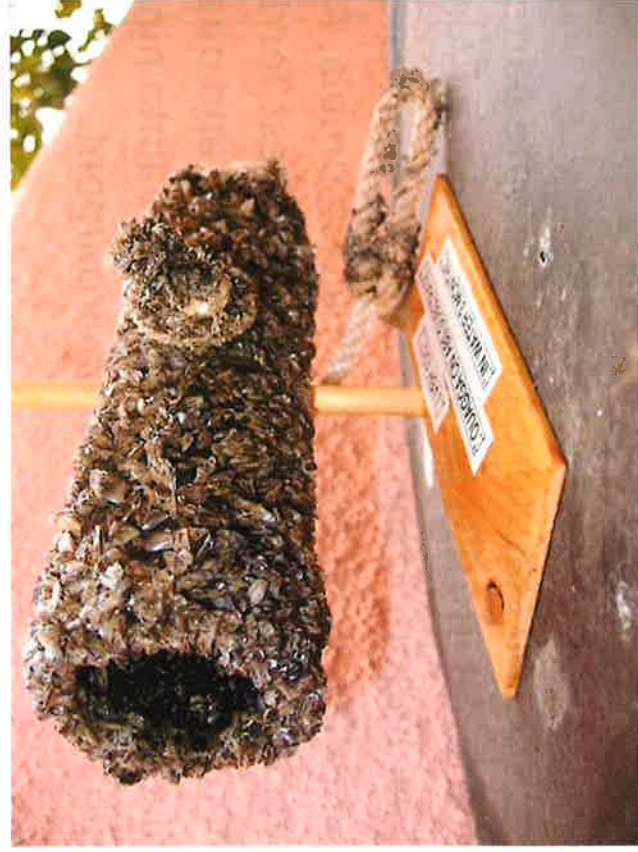
Quagga Mussel ( Dreissena bugensis ) and Zebra Mussel ( Dreissena polymorpha )