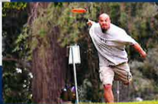
Teeing off at Three Island Crossing