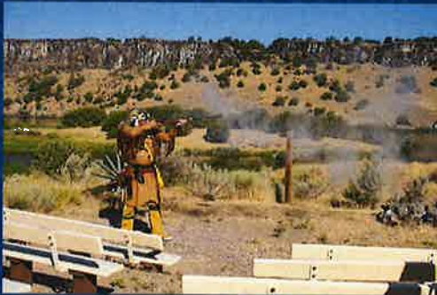
Living history presentation at Massacre Rocks State Park