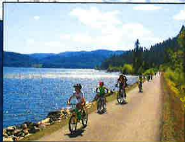
Groups using the trails at State Parks on dirt, snow and pavement