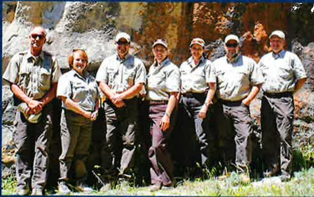
Staff at Castle Rocks State Park