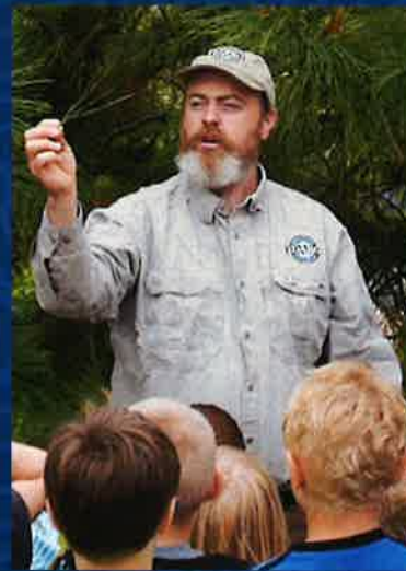
Interpretive presentation at Lake Cascade State Park