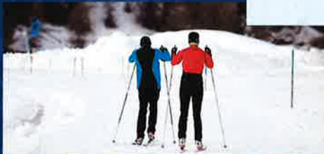
Nordic Skiers at Ponderosa