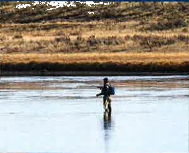
Angler at Harriman