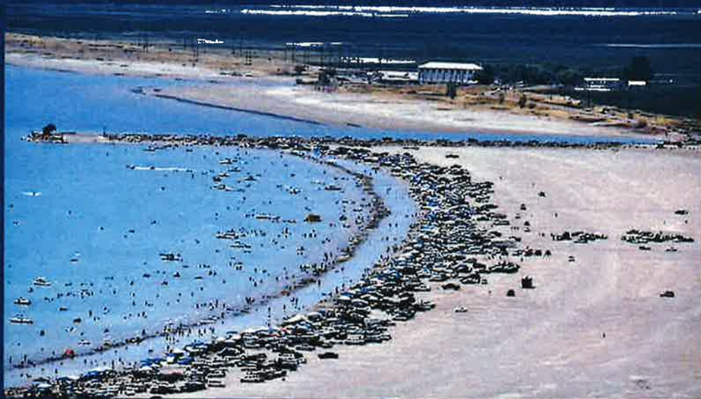
Bear Lake State Park on a summer weekend