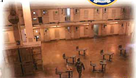
State Emergency Response