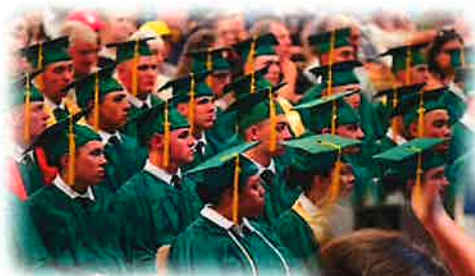
Idaho Youth Challenge Program