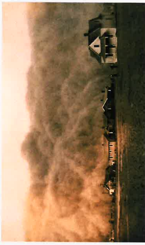
Stratford, Texas, 1935

During President Roosevelt's first 100 days in office in 1933, several government programs were set forth to conserve soil and restore ecological balance.