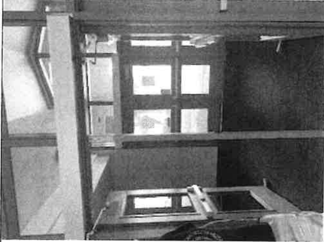
Post Falls- New Vision High School, Secure Vestibule