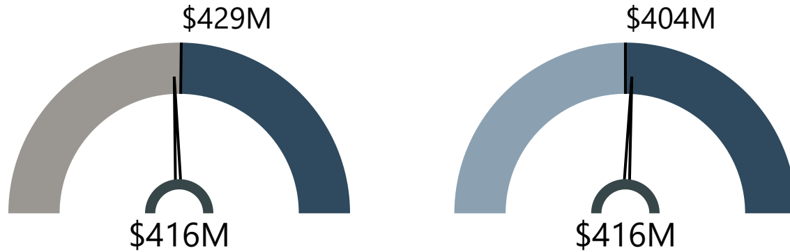
FY22 Compared to FY23

Note: the revenue amount displayed below the dial indicates actual July FY23 revenue, the amount shown above the dial indicates the target amount (either Division of Financial Management July FY23 forecast on the left dial or July FY22 on the right). The dial needle demonstrates if the current revenues fell short of or exceeded the predicted amount.