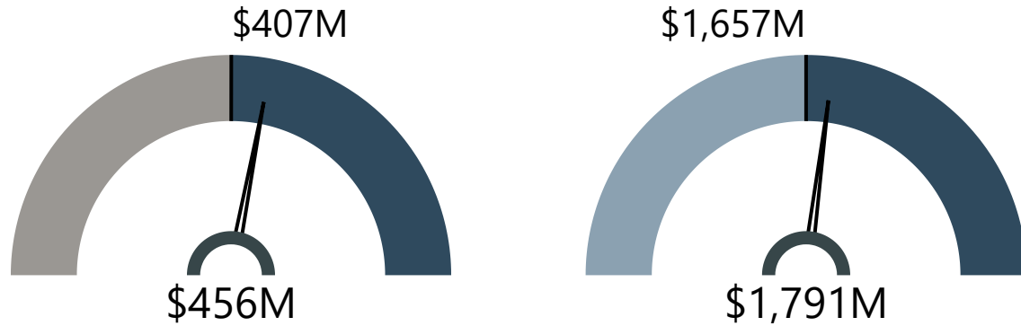
FY22 Compared to FY23

Note: the revenue amount displayed below the dial indicates actual October FY23 revenue, the amount shown above the dial indicates the target amount (either Division of Financial Management October FY23 forecast on the left dial or FY22 FYTD revenues on the right). The dial needle demonstrates if the current revenues fell short of or exceeded the predicted amount.