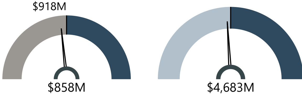
FY23 Compared to FY24

Note: the revenue amount displayed below the dial indicates actual April FY24 revenue, the amount shown above the dial indicates the target amount (either Division of Financial Management April FY24 forecast on the left dial or FY23 FYTD revenues on the right). The dial needle demonstrates if the current revenues fell short of or exceeded the specified amounts.