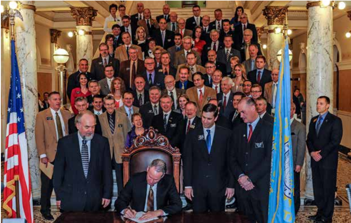
Gov. Dennis Daugaard signs the Public Safety Improvement Act into law Feb. 6, 2013.