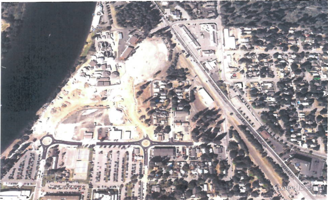
After Development Partnership with Urban Renewal Agency: