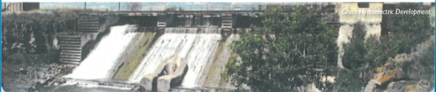
Grace Hydroelectric Development

Some of the renewable attributes associated with PacifiCorp's owned hydro electric facilities may be used to comply with state renewable portfolio standards or other regulatory requirements, or sold to third parties in the form of renewable energy credits or other environmental commodities.