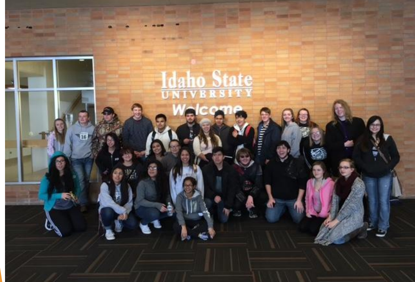
"Dude, did you know I'm going to college? I just found out today." Student Quote