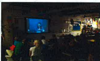
Virtual Field Trips/ Lessons