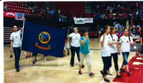
Idaho students at National History Day