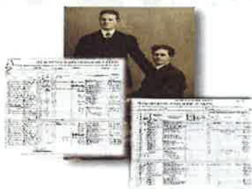
Online Primary Source Database