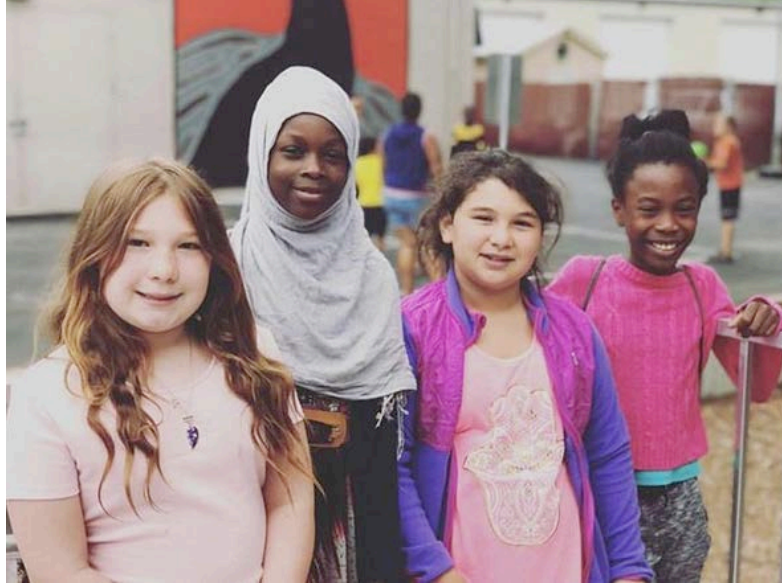
Students from Future Public Charter School