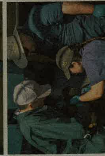
Attachment 1 - March 16, 2023