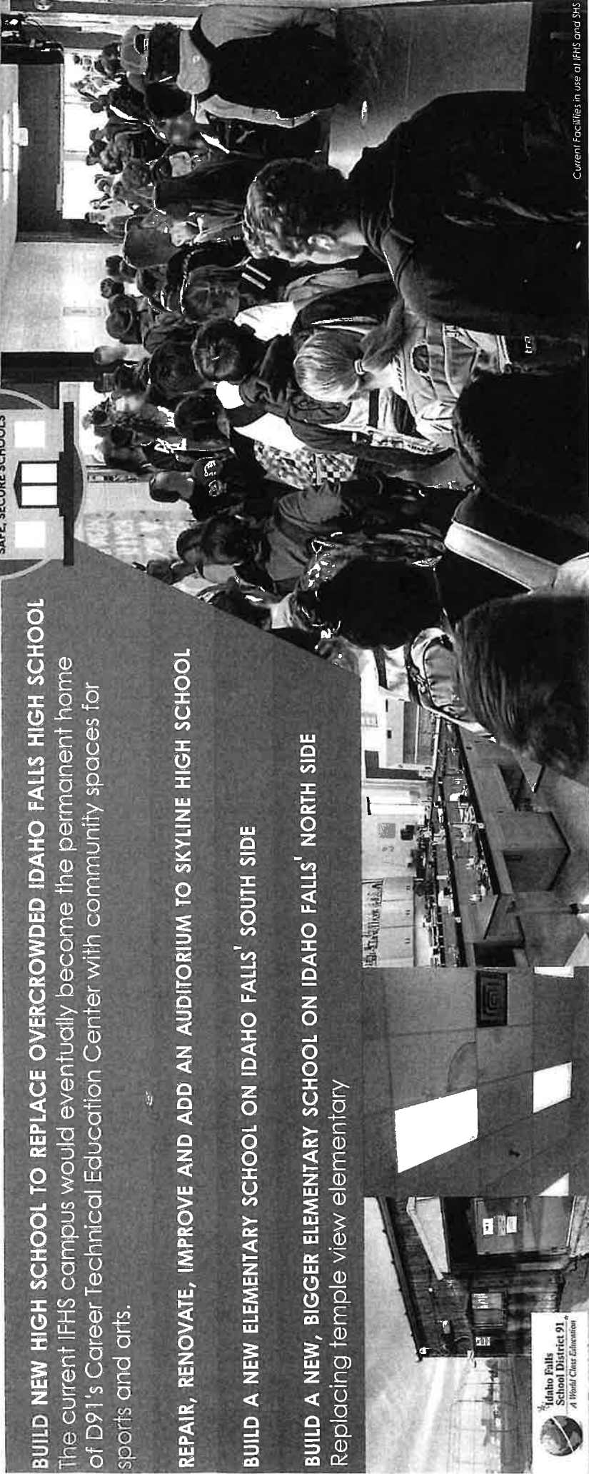
Current facilities in use of IFHS and SHS