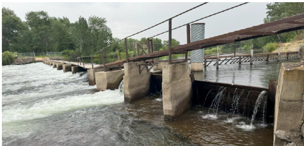
The existing Ridenbaugh Diversion Dam dates to the early 1930s.

The Ridenbaugh Canal Diversion Dam extends approximately 220 feet across the Boise River, just upstream of the Eckert Road Bridge and Barber Park. The existing diversion dam, built in the early 1930s, is used to raise the upstream water level, allowing water to be diverted from the Boise River into the Ridenbaugh Canal. The dam