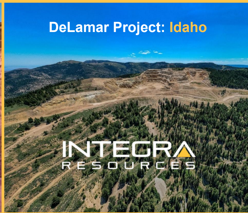
DeLamar Project: Idaho