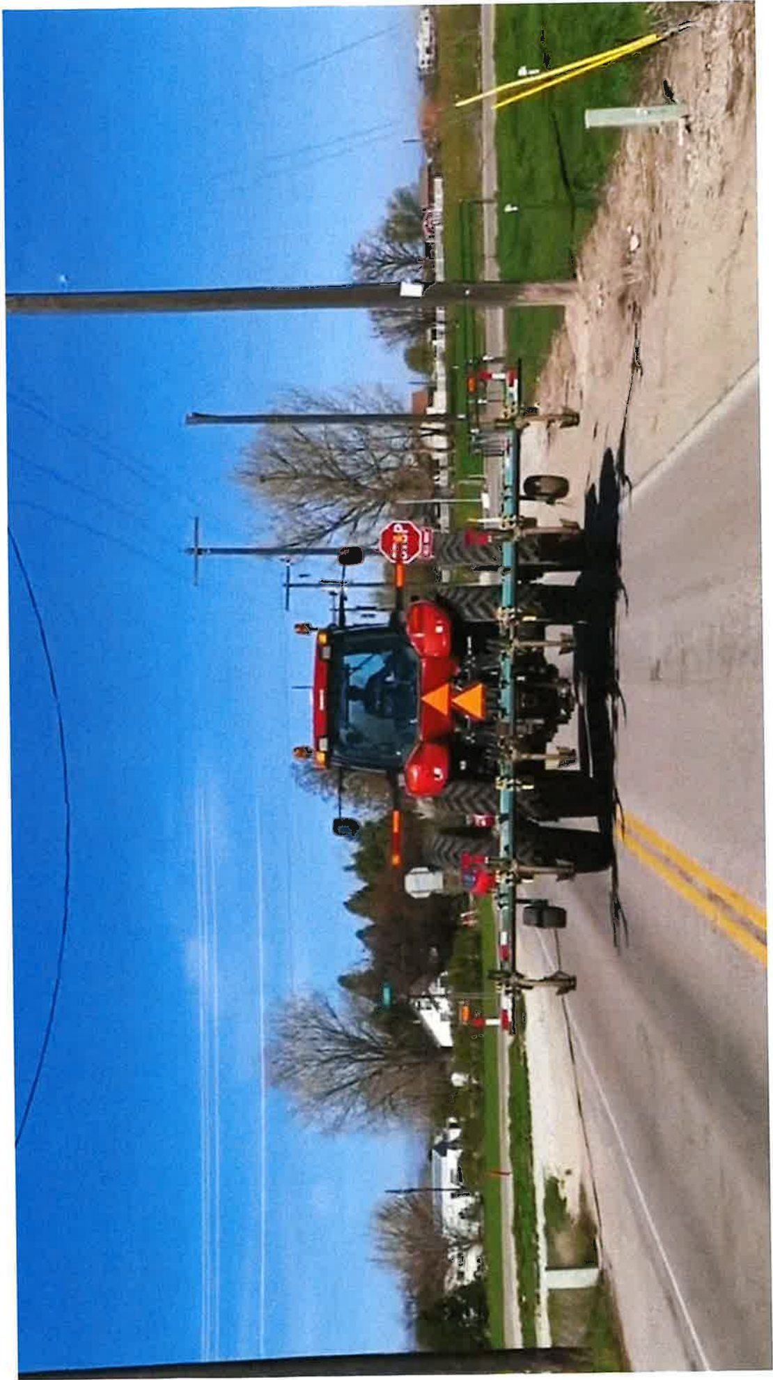
February 24, 2026 - Attachment 1