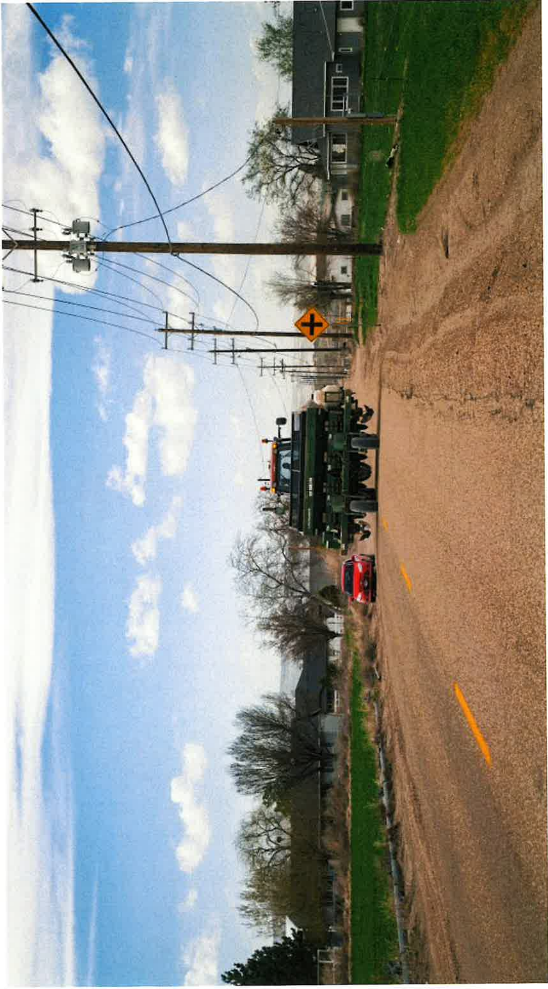
February 24, 2026 - Attachment 1